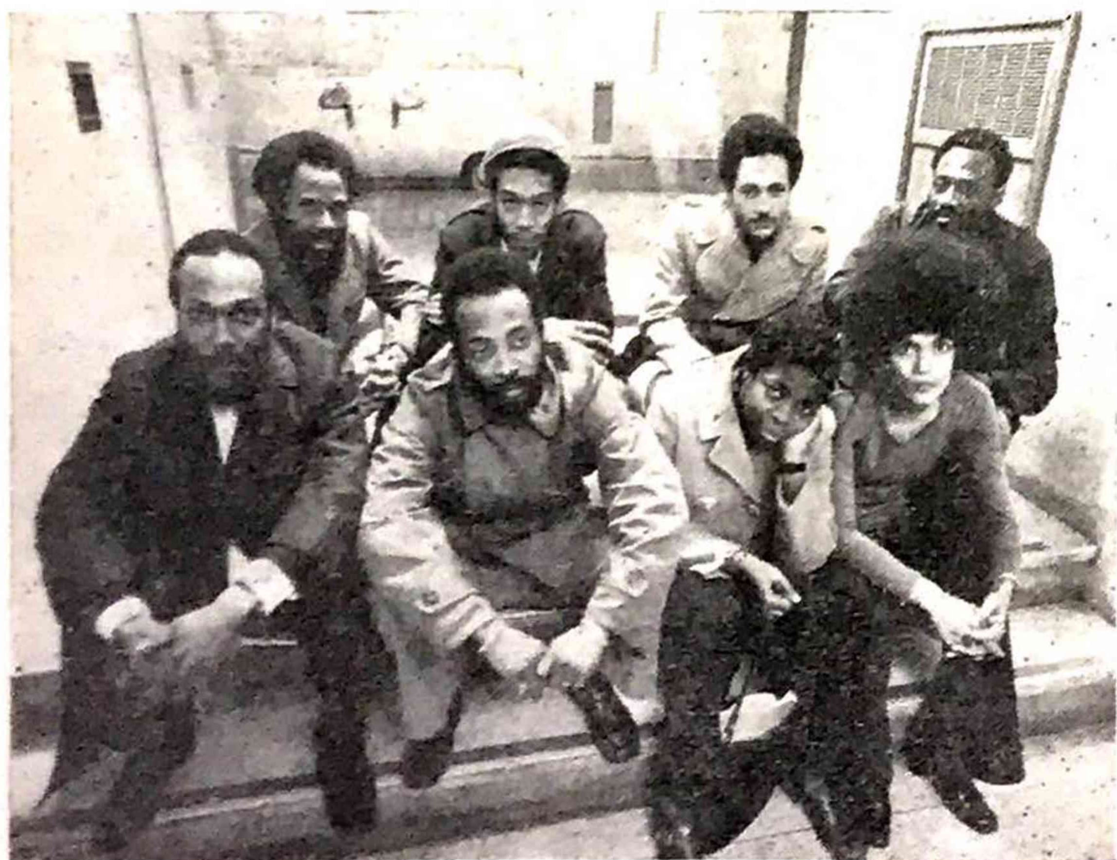
Eight of the 'Mangrove Nine'