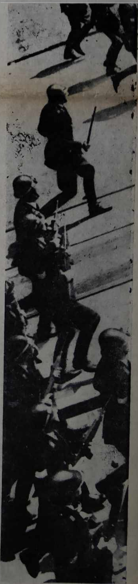
Soldiers charge demonstrating building workers in Amsterdam.

Shortly after the war the Social Democrats had a big influence in Parliament and so important positions in the Government of the time, they effected a wonderful thing: Peace and Quiet on the Labour Front. Everyone should have the best intentions to rebuild the country, they said (and forgot that some only had the bad intention to quickly fill their pockets and increase their bank accounts) and it was therefore necessary to obliterate the struggle for better wages and positions. Therefore a Council was installed which was formed from delegates of (only) three unions, delegates of different employers' unions (yes! these too are grouped according to religious beliefs!)