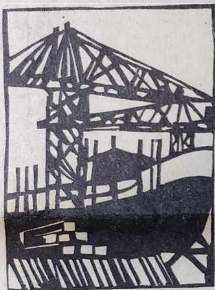
De Bezige By, Amsterdam, 1965) which made many people speak and think (but not act) about the influence of Nazi doctrines, 20 years after...