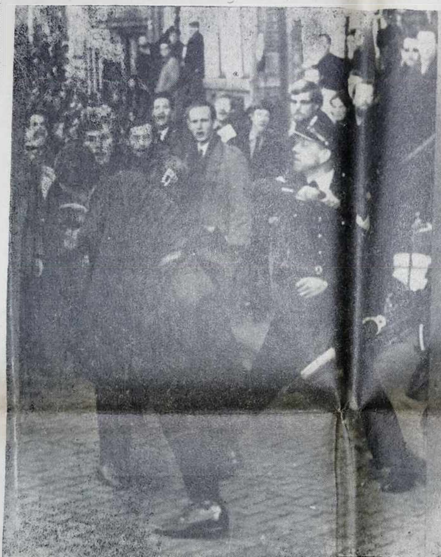
Police hitting provo.

According to the Bible, Christ has said that one shouldn't kill. It was talked about already in the Old Testament, but Christ repeated and stressed this message, this order. The Catholic church has always opposed this by maintaining Paul's reasoning, that the state had received power of arms by permission of God, and that the state should be obeyed. The Protestant church in general has followed this example, but because of different structure from the Catholic hierarchy (Protestantism being born out of disobedience to the Catholic