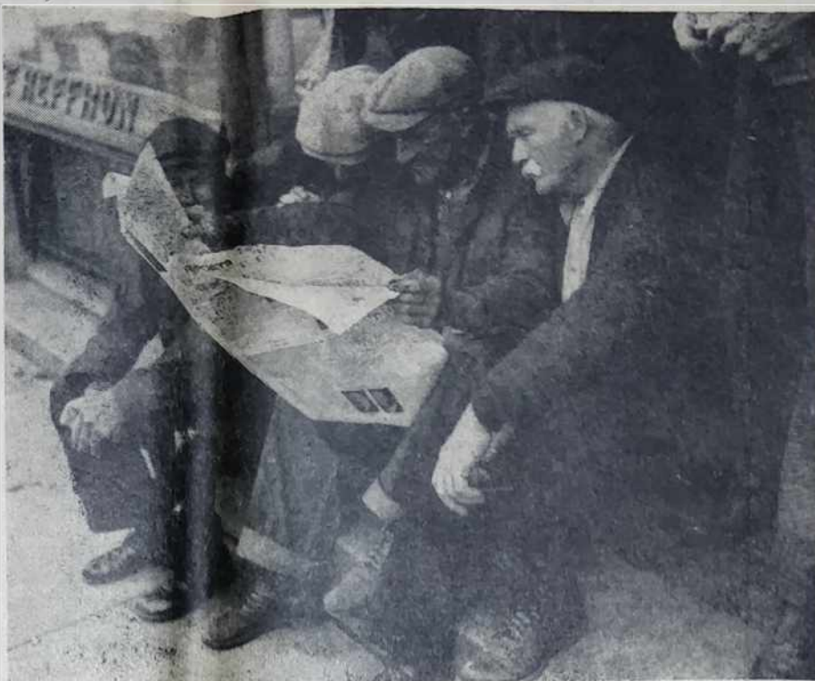
Part of the army of unemployed—1936.

Look at that gal shake that thing; We can't all be Martin Luther King. In the thirties, Communists and their friends juggled deftly the categories of