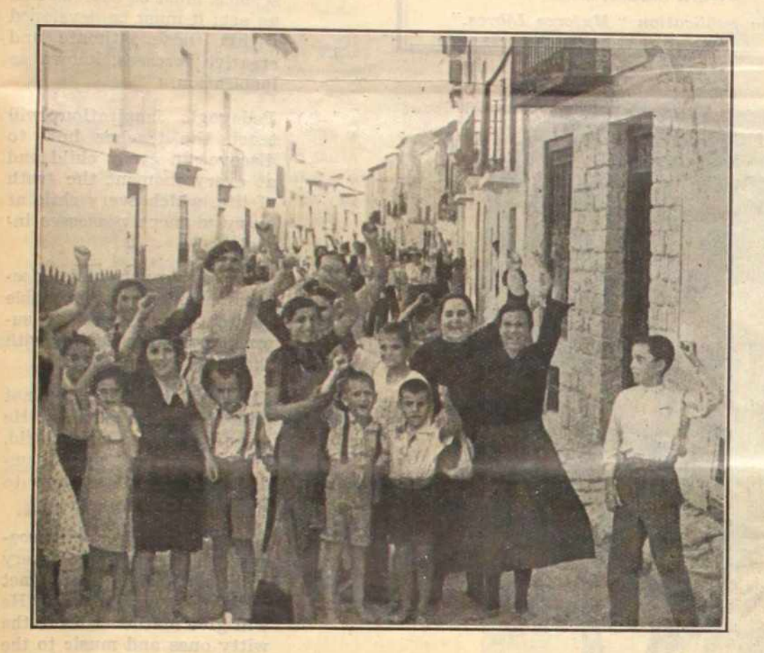
The village turns out in force to welcome the Anti-Fascist militiamen. A "still" from the film "Fury Over Spain." (See page 4)