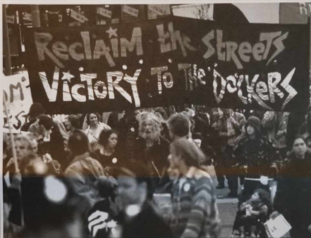
Mixing industrial and environmental action on 12th April 1997

On the morning of them having a coffee with colleagues from other allied health profession unions I read in the Guardian that there would be no dispute! We knew nothing about it but basically the big unions had already done a deal which allowed limited local bargaining. Rather than negotiating with the government we spent most of the day arguing with the likes of Unison and MSF (now Unite) who wanted us to sign up to the deal