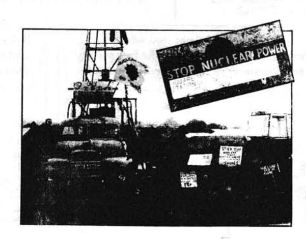
illustration taken from the Leveller