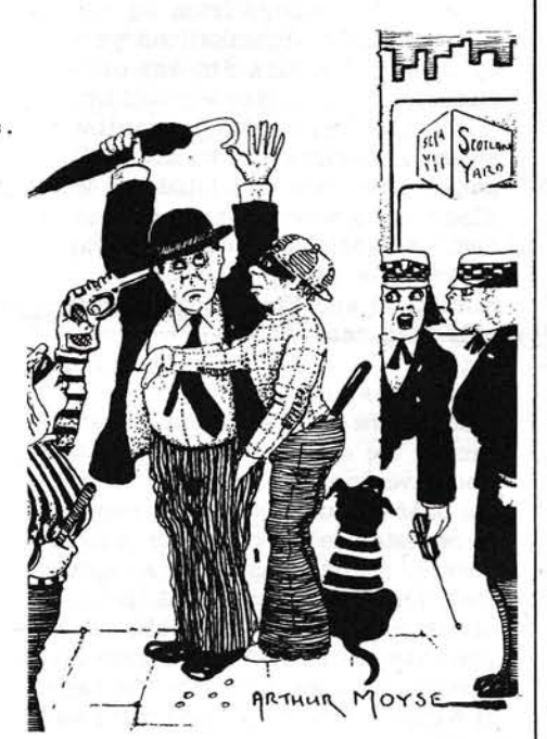
"It's alright, they say they're monetarists! "